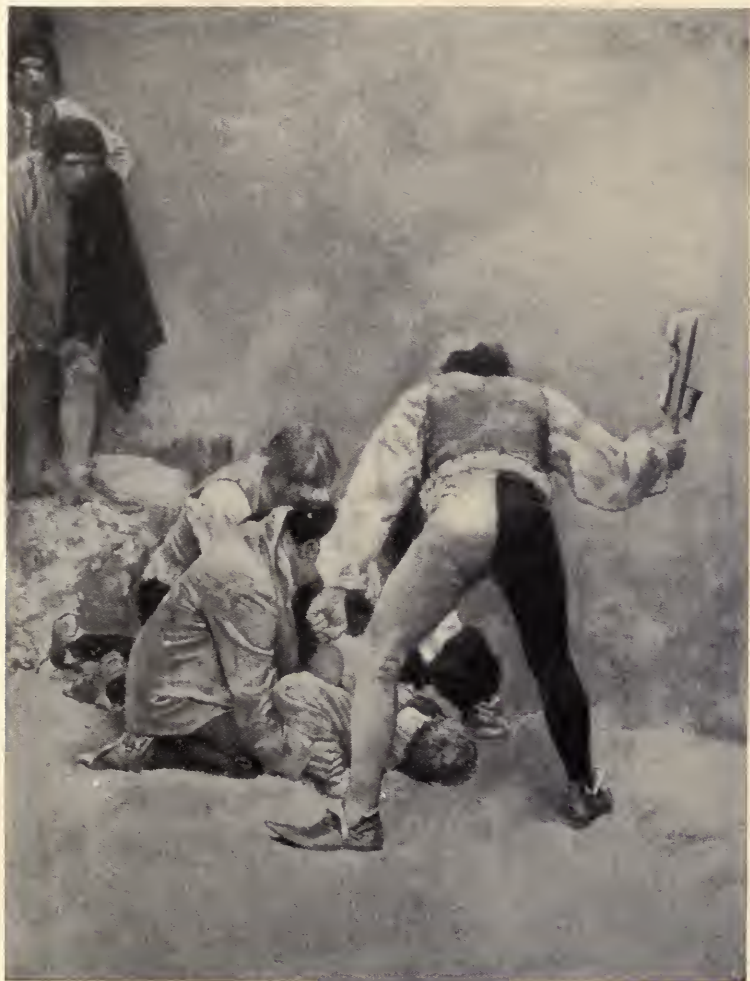
"At last they had the poor boy down"